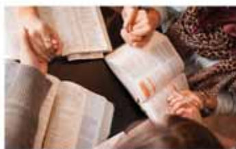
Wednesdays • 6p WOMEN MAKING CONNECTIONS