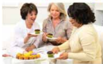
4th Tuesdays JOY CHICK FLICK & LUNCH BUNCH

Check out these and all available small groups in REALM ( Community>Groups>Find Groups )