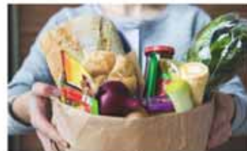
after a birth/adoption THE FOOD STORK