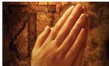
Mondays • 12p CENTERING PRAYER