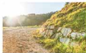
2nd Tuesdays • 9 a.m. GOOD MORNING, LORD