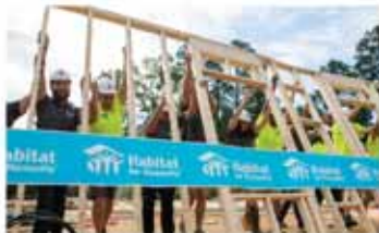
one Saturday each quarter HABITAT HOMIES