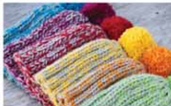
1st & 3rd Sundays • 9:45a KNITTERS FOR CHRIST