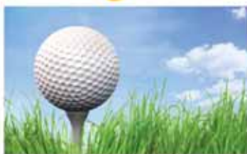
once a month FAIRWAY TO HEAVEN